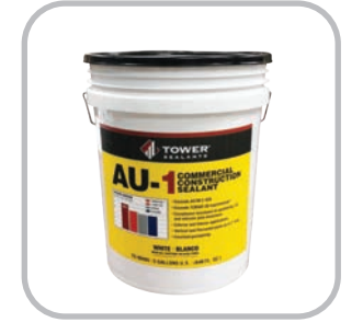
2 gal. Pail or 5 gal. Pail