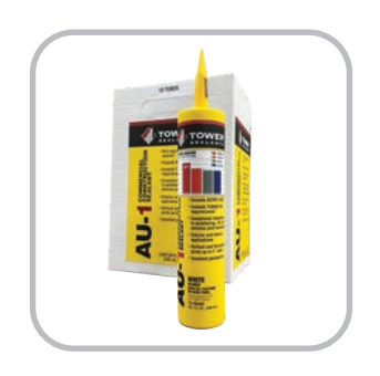
10.1 oz. Cartridge