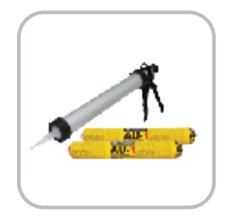
20 oz. Sausage