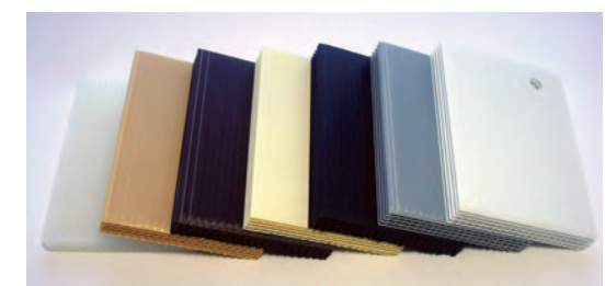
CellVent<sup>™</sup> by Mortar Net Solutions<sup>™</sup> Colors available: (left to right) clear, cocoa, brown, tan, black, gray, white